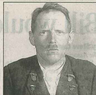
Leopold Engleitner, photographed by the Gestapo in 1939